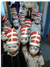
PK3 celebrates Dr. Seuss's birthday AND MardiGras together!

As always, we enjoy seeing your children everyday!