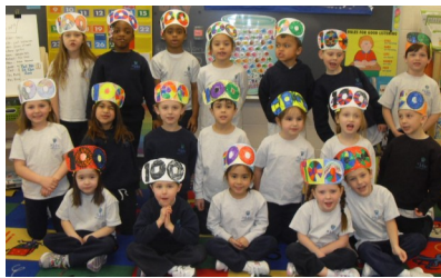
KA and KB celebrate 100 days of school!